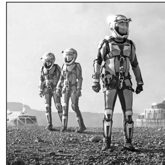
Season 2 of "Mars" premieres Monday on National Geographic.

Premiering Monday, Nov. 12, the six-episode second season finds the astronauts of Olympus Town living on and exploring the Red Planet and its mysteries. But to keep the expensive mission going, it partners with Lukrum Industries, which agrees to provide funding in return for the lucrative rights to Mars' natural resources. Which puts it in direct conflict with the scientists at the base.