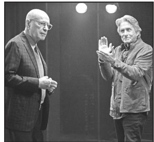
Alan Arkin (left) and Michael Douglas star in "The Kominsky Method," premiering Friday on Netflix.

In his first TV series since "Streets of San Francisco" more than 40 years ago, Michael Douglas shows off formidable comedic chops as an aging acting coach whose life didn't quite turn out as planned in a dramedy premiering this week on Netflix.