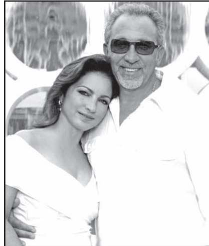
The musical couple is saluted in Friday's new PBS special "Gloria and Emilio Estefan: Library of Congress Gershwin Prize for Popular Song" (check local listings).

The couple's writing, producing and per-