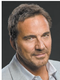
Thorsten Kaye stars as "Ridge" on "The Bold and The Beautiful"

DAYS OF OUR LIVES Brady objected when he learned that Kate wanted a job at Titan. Will had a scary episode. Gabi stepped up her efforts to seduce Stefan. Eric made a surprising offer after learning that Rex and Sarah set a date for their wedding. Chloe was furious about Brady's deception. Marlena and Sonny waited anxiously for news about Will. Gabi and Ciara were held hostage by a member of the cartel. Brady found Chloe in a dangerous predicament. Rafe confided in Lani about his argument with Hope. Rex confronted Eric about his feelings for Sarah. Rafe was rushed to the hospital after getting shot. Hope and Ben teamed up to rescue Ciara. Gabi kissed Stefan. Eli overheard a mysterious phone call. Wait to See: Ciara tries